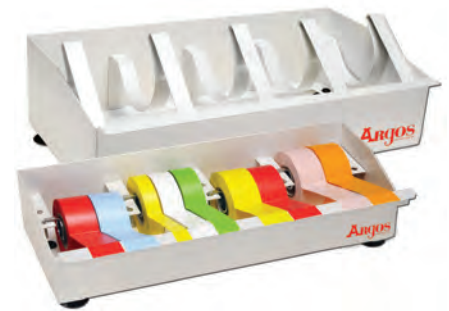
LA/10360 and LA/10362