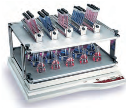
SH/25300 &amp; SH/25320