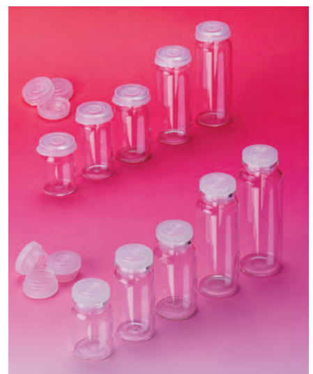
VI/4223 and VC/461